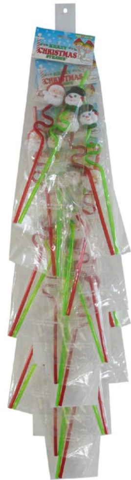
2pk Topper Straws 105X-04DCLIP