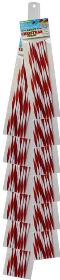
8pk Christmas Straws 609X-04