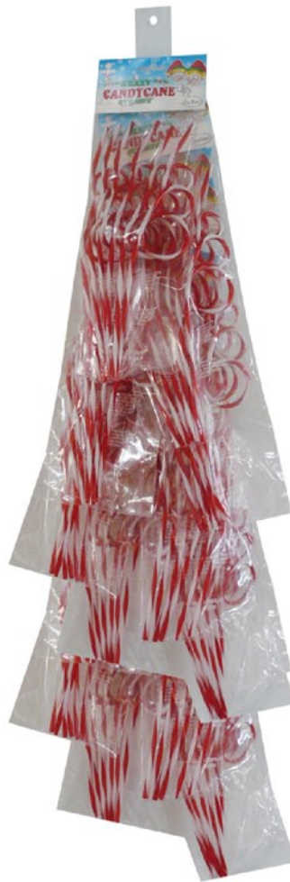
6pk Candy Cane Straws 685X-04CLIP